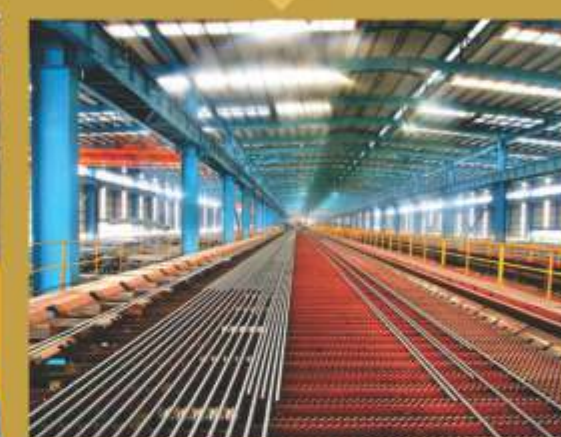
Cooling Bed ➡