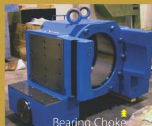
Bearing Choke ➡