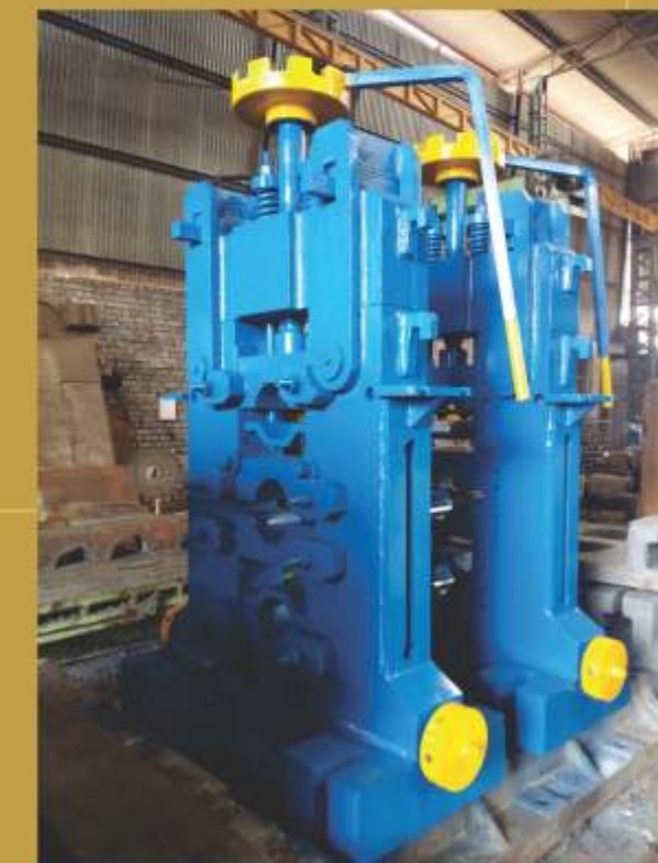
Rolling Mill Stand ➡