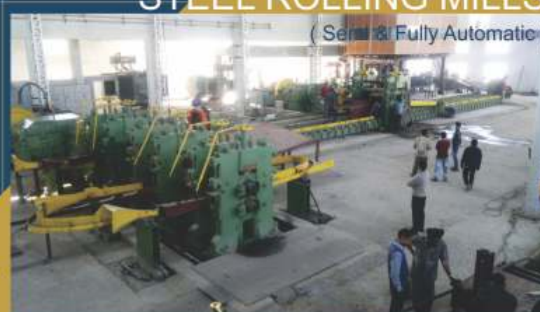
Erection Of Rolling Mill ➡