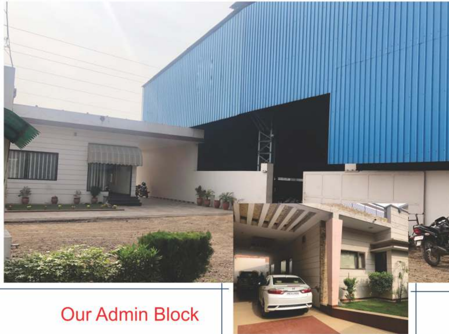
Our Admin Block