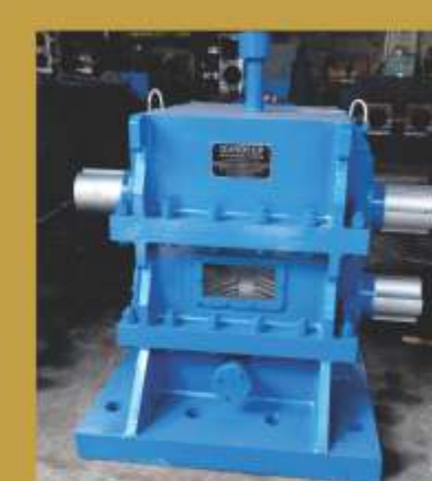
Gear Box ➡