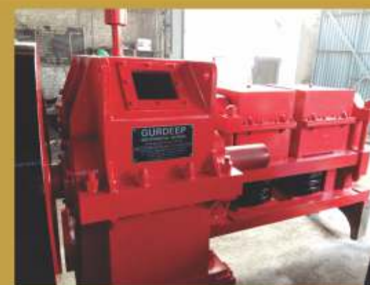
Vertical Rolling Mill Stand ➡